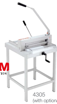
4305 (with optional stand)