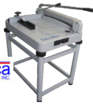
Guillomax (with optional stand)