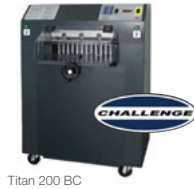
Titan 200 BC