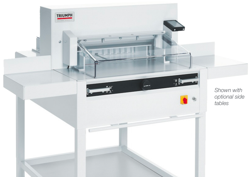
Shown with optional side tables