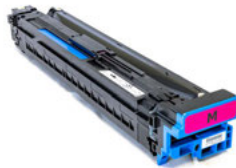
MISP1360-D-MG Magenta Drum