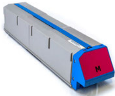
MISP1360-T-MG Magenta Toner