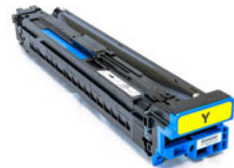
MISP1360-D-YE Yellow Drum