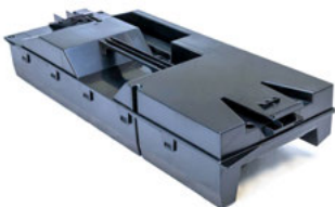
MISP1360-WASTE Waste Toner