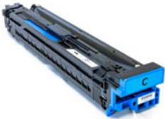
MISP1360-D-CY Cyan Drum