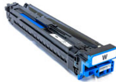
MISP1360-D-WH White Drum (SP1360W)