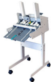
MISP1360DF330 DF-330 Laser Envelope Feeder