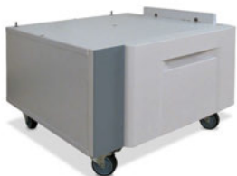
MISP1360CABINET Printer Cabinet