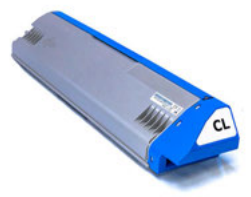
MISP1360-T-CL Clear Toner (SP1360S)