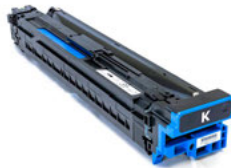
MISP1360-D-BK Black Drum