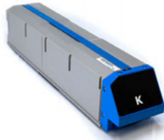
MISP1360-T-BK Black Toner