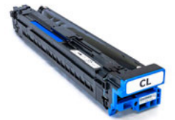
MISP1360-D-CL Clear Drum (SP1360S)