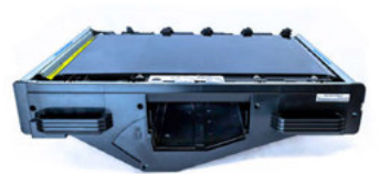
MISP1360-BELT Transfer Belt