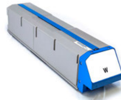
MISP1360-T-WH White Toner (SP1360W)