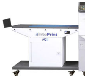
MISP1360-HC-CONV HCC Envelope Conveyor