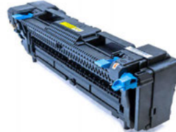
MISP1360-FUSER-ENV Fuser for oversized envelopes