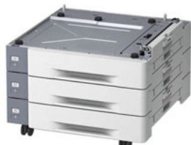
MISP1360HICAP High Capacity 3-in-1 Tray