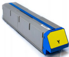
MISP1360-T-YE Yellow Toner